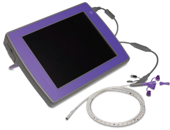
Kangaroo™ IRIS Console