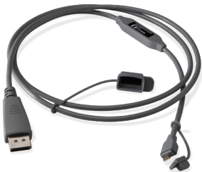
Kangaroo™ Interface Cable