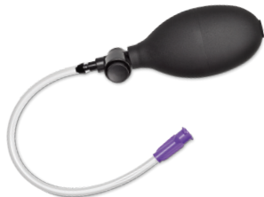
Kangaroo™ Insufflation Device