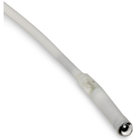
Kangaroo™ Feeding Tube with IRIS Technology

For more information, contact your local sales representative or customer service at 800.964.5227